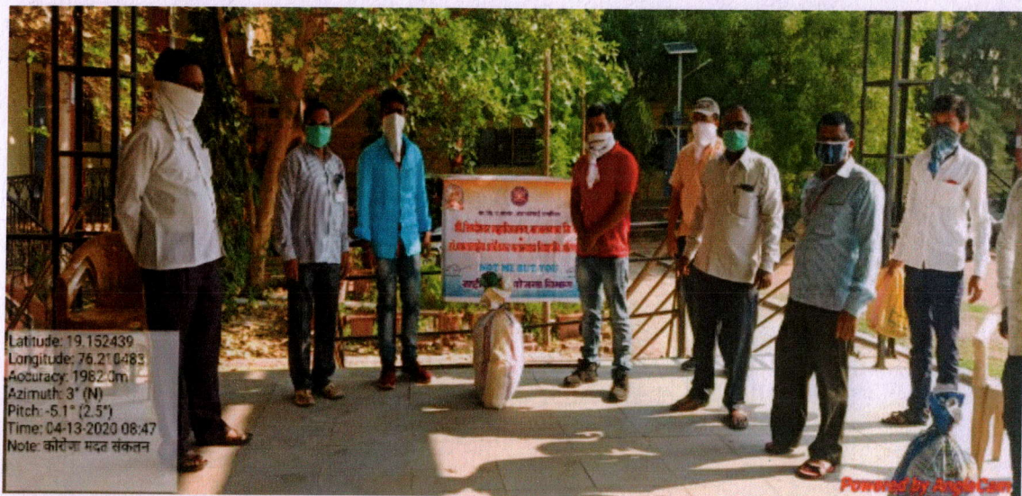
Helping hand of college to many families in covid epidemic 2019-20. Essential commodities were distributed to needful families.