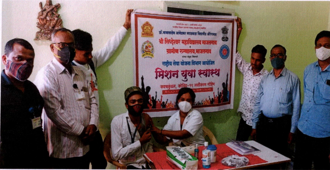
Covid vaccination camp in college 2021-22.