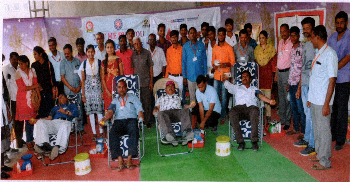
Staff members and students voluntarily donating blood on the occasion of Mahaparinirwan din, death anniversary of Dr. Babasaheb Ambedkar 2018-19.