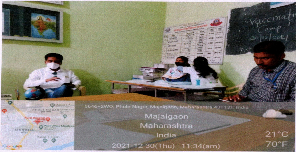
Covid vaccination among students in the covid epidemic 2021-22.