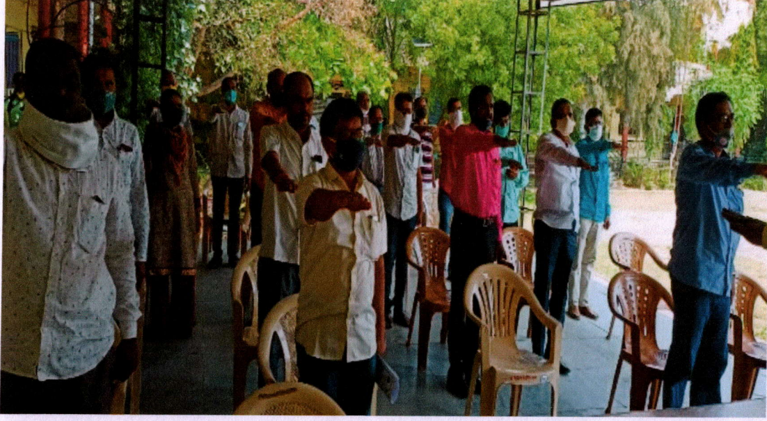
De-addiction oath is being taken for the healthy society by college staff 2020-21.