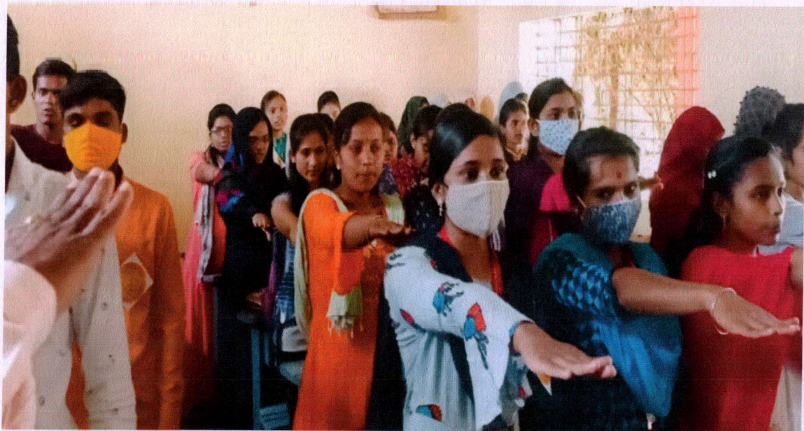
De-addiction oath is being taken by students 2020-21.