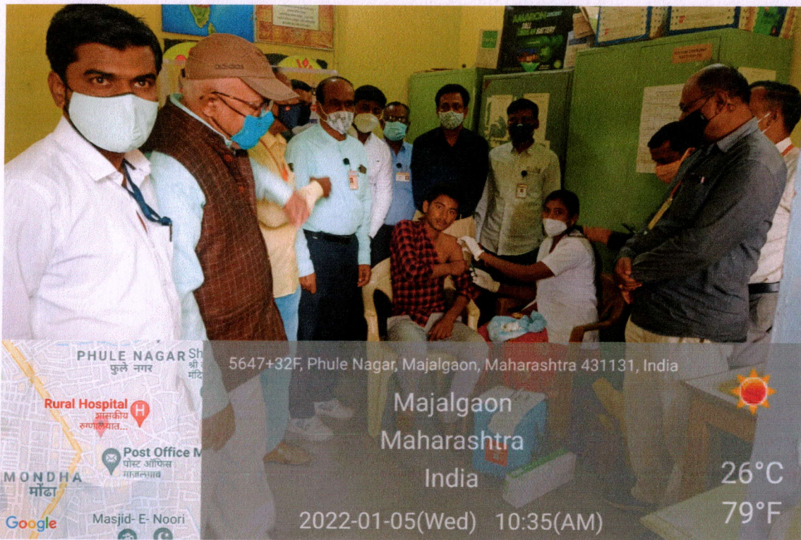
Vaccination camp for covid-19 organized in college for students & staff 2021-22.