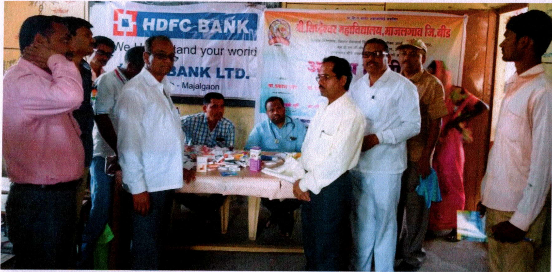
Health check-up and De-addiction camp by college for students, faculty members and society with the help of HDFC bank, Majalgaon 2017-18. Staff members with doctors and people are seen in the photo.