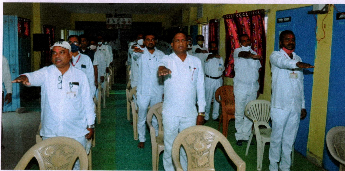
College staff is taking De-addiction oath 2021-22.