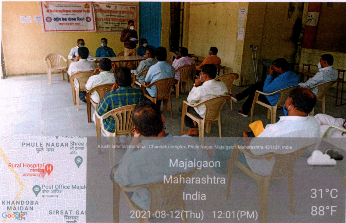
Guidance on HIV/AIDS with the help of staff of the rural hospital Majalgaon 2021-22.