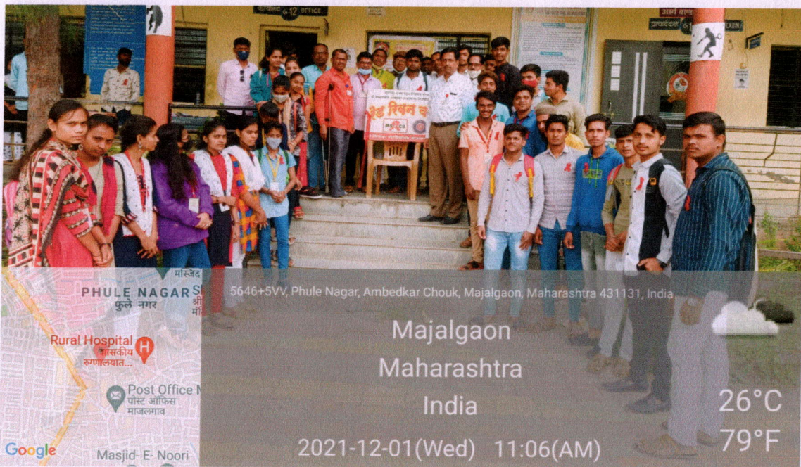
Red ribbon club organized the program about the precautionary measures to prevent AIDS on the eve of world AIDS day 2021-22.