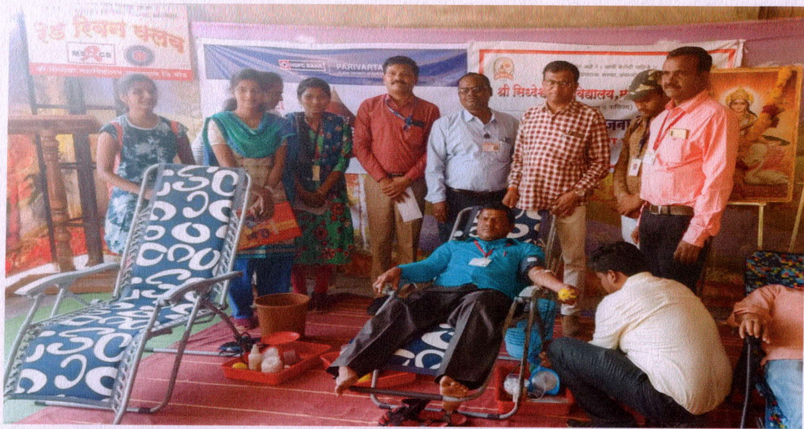
Blood donation camp on the eve of Mahaparinirwan din, death anniversary of Dr. Babasaheb Ambedkar. The members of the institute and staff members involved in the blood donation 2019-20.