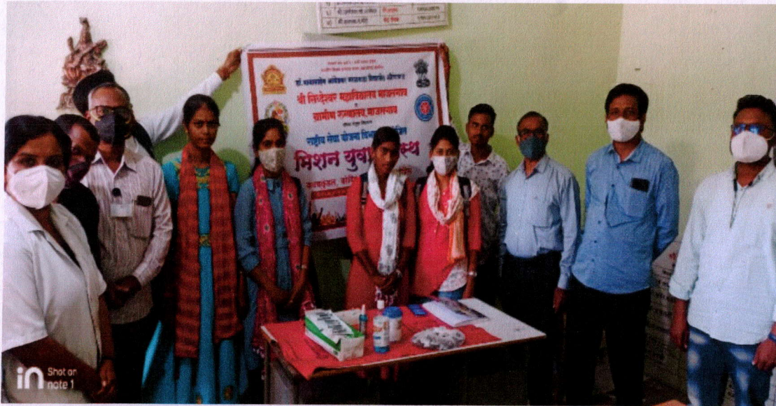
Covid vaccination camp in college 2021-22.