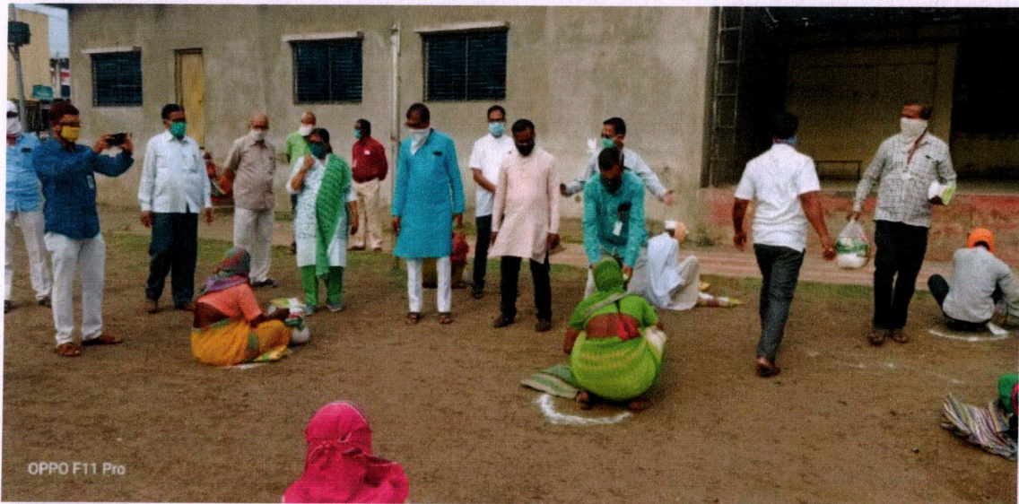
During the corona virus epidemic, our college helped to many needful families in supplying the ration and other essential things in lockdown period 2019-20.