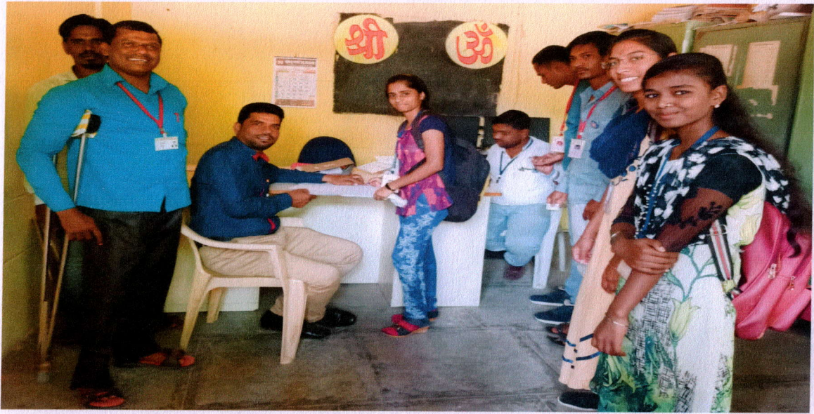
Health checkup camp of students in college 2019-20