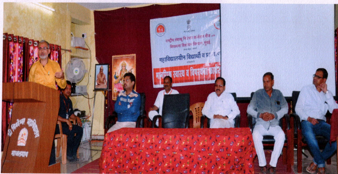
Guidance to staff members and students on 'Mental Health and De-addiction' by National Tobacco Control Program, Beed 2017-18.