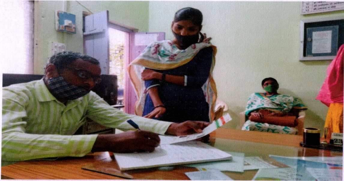
Covid vaccination camp in college 2021-22.